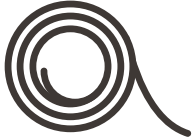
6' Sticker-Tite Rubber Gasket